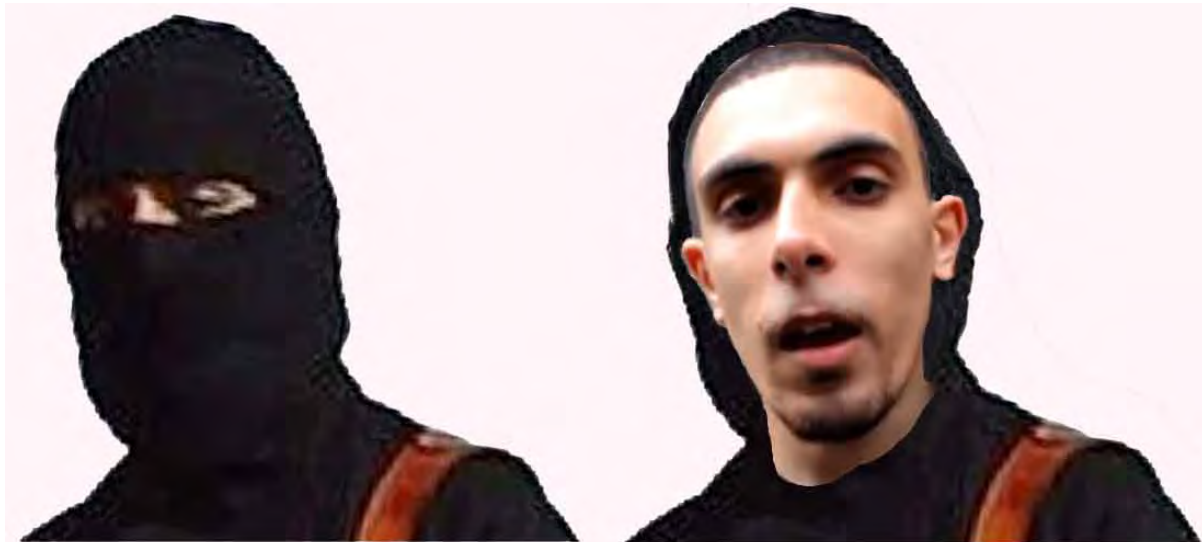
The ISIS Butcher