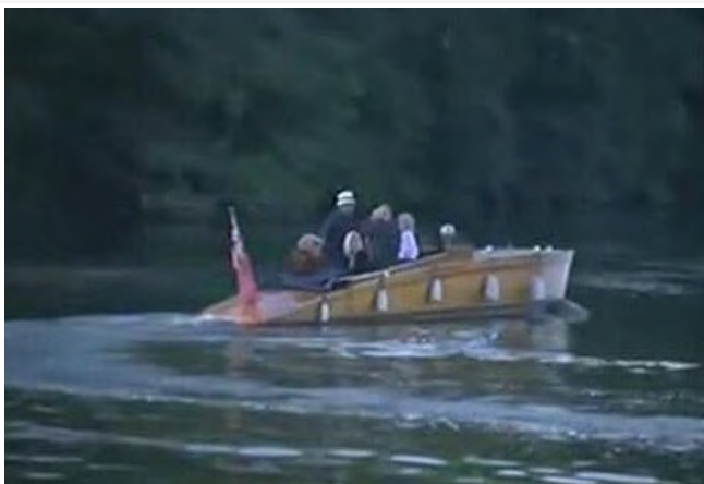
Judgment day... Rolf Harris avoids reporters by travelling by boat as he faces jail for indecent assaults.

The court heard from six other women who had been assaulted as girls in Australia, New Zealand and Malta but outside the UK jurisdiction for prosecution. But there are more than a dozen other women who have also made claims against the star from across Australia and the UK. Those claims are still being reviewed and no decision made on whether they can or will be prosecuted.