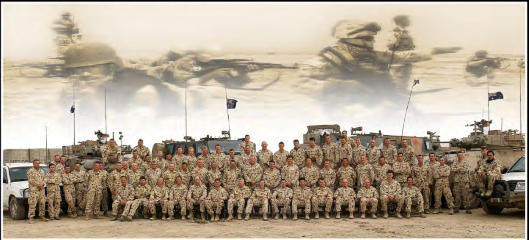
Australian Army Training Team Iraq - 5