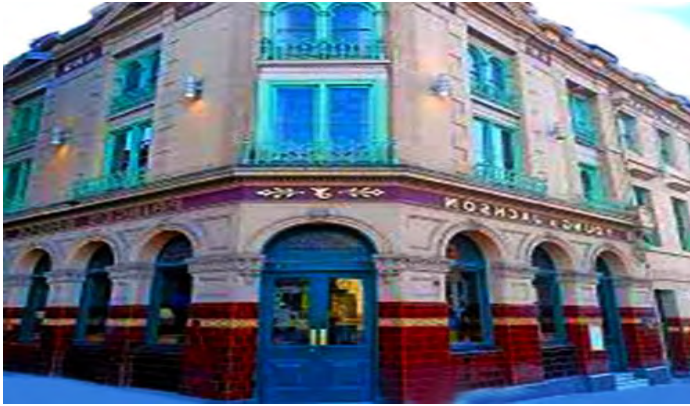
Young and Jacksons – Melbourne